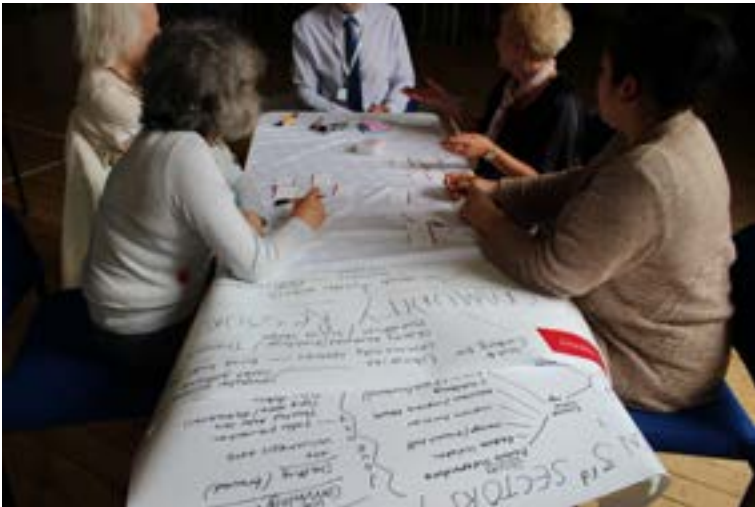
Figure 1. Co-designing speculative design concepts with senior citizens in the UK.

ProtoPolicy included several co-design sessions with a group of senior citizens living independently and a group of senior citizens, living in sheltered accommodation. The workshop insights and co-designed speculations were translated into a series of Speculative designs. This was achieved by analysing and coding the captured data and then crafting the artefacts, by thematically sorting the participants' insights and giving consideration to the areas of contention that might be exposed in debate on an imagined future (Darby et al, 2016).