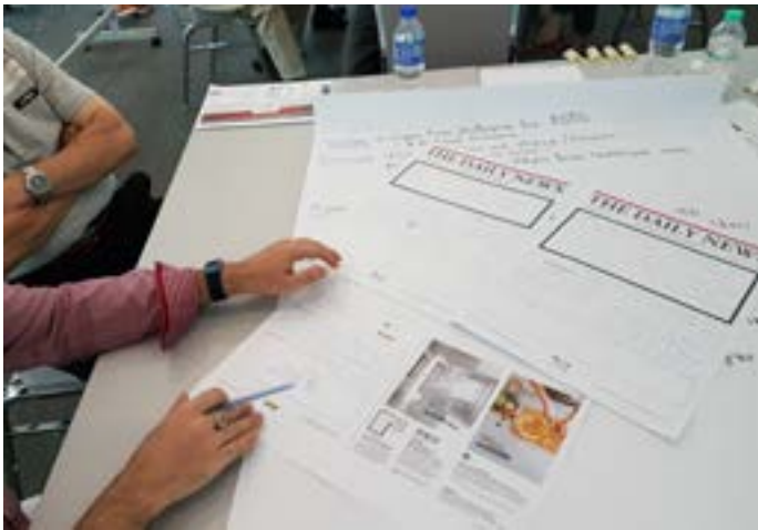
Figure 3. Co-designing speculative design concepts with senior citizens in Malaysia.

ImaginAging followed a co-design research methodology similar to ProtoPolicy. It included workshops with senior citizens living independently in the community and a workshop with experts. Speculative designs were developed by workshop participants, which were then refined by the research team into higher quality prototypes.