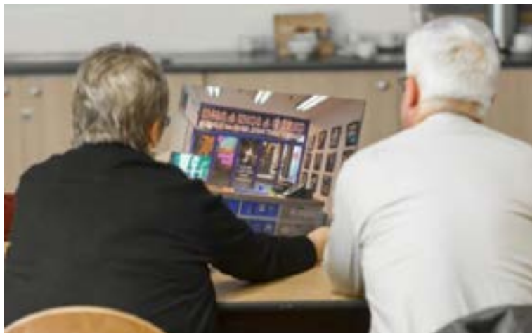
Figure 5. Citizens exploring the speculative designs and offering debate.

Guided discussions also allowed participants move beyond polarising debates for 'good' or 'bad' to voice opinions about the images that were not so immediately obvious – for example, their positive aspects – and the points of conflict within them (for example, how certain elements were viewed as positive or negative by different participants). This also allowed us to steer discussion away from a too-heavy focus on the technological realism of what was portrayed in favour of considering the future possibilities intimated by these artefacts (Voss et al., 2015).