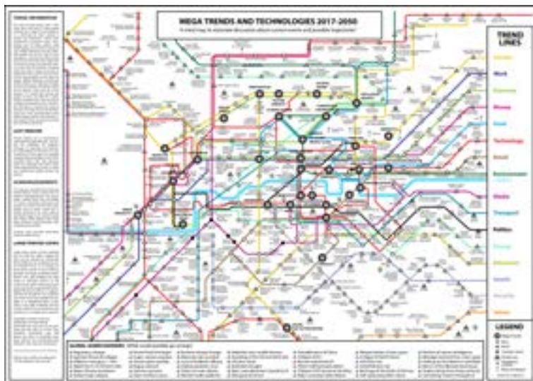
Figure 6. Trend map example (Source: Richard Watson, www.nowandnext.com , 2019).

The PESTLE framework may be familiar to some as it is commonly used in risk management where more headings are developed below each category. PESTLE is a mnemonic which in its expanded form denotes P for Political, E for Economic, S for Social, T for Technological, L for Legal and E for Environmental. It gives a bird's eye view of the whole environment from many different angles that one wants to check and keep a track of while contemplating on a certain idea/plan.