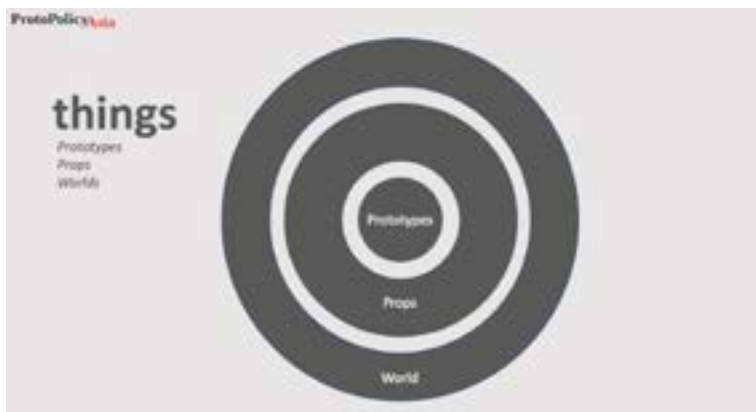
Figure 8. Developing speculative design prototypes, 'things'.

The speculative design, the thing, springs from the speculation. Therefore, developing the idea for a product, service, or bundled product and service helps articulate the story of a thing. Someone has a problem, a solution is presented through design, the problem is alleviated or resolved, and a life is transformed.