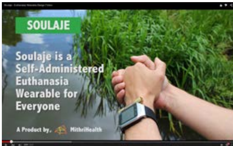
Figure 2. The self-administered euthanasia speculative design.

The two speculative designs included a self-administered euthanasia wearable device, and the Smart Object Therapist, which combines occupational health with experience in pervasive and assisted home technology to ensure that future smart home appliances correspond to user needs (Tseklevs et al, 2017b). The former speculative design was designed as a response to the workshop co-designers expressed needs for self-control and living with dignity and was aimed at opening further the debate around the ethical and legal aspects of technology-enabled assisted dying (see Figure 2).