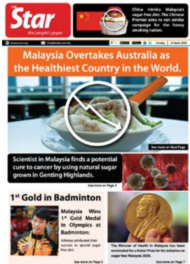
Figure 4. The 'Sugar-free Malaysia 2050' speculative design.

The group developed a 'Sugar-free Malaysia 2050' speculative design concept, which comprised of two speculative design prototypes. A future newspaper with two different front headline covers set in 2050 (one presenting the benefits this policy initiative will bring to Malaysia in terms of health, economic and social development; and the other presenting what will happen if high sugar consumption continues in Malaysia). A 'sugar neutraliser' speculative design was also developed presenting a future product, and thus showing that a new market may emerge in this area, which removes any processed sugar content from drinks and food.